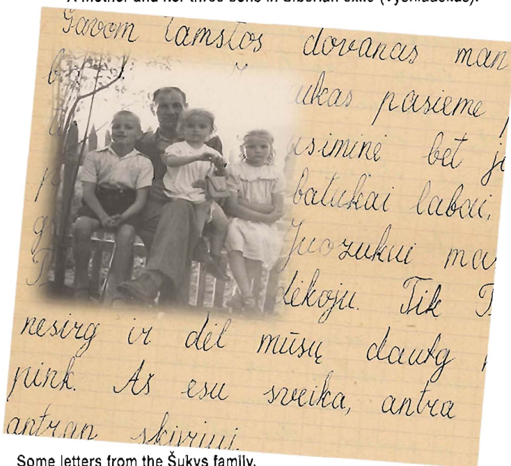
Some letters from the Šukys family.