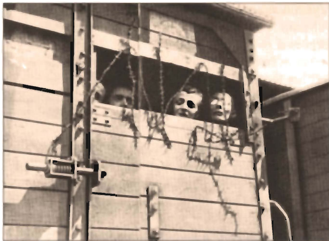
OPPOSITE PAGE: A brigade of deported Lithuanian women working on the Trans-Siberian Railroad in the Tiumen region of Siberia, 1954; ABOVE: This is the way deportees, men, women and children, were transported to the slave labor camps of Siberia—worse than cattle.

numbers of deaths due to Stalin's brutality far exceeded those of Hitler. His death machine functioned at the same time as Hitler's and in the same geographic location, but produced many more casualties.