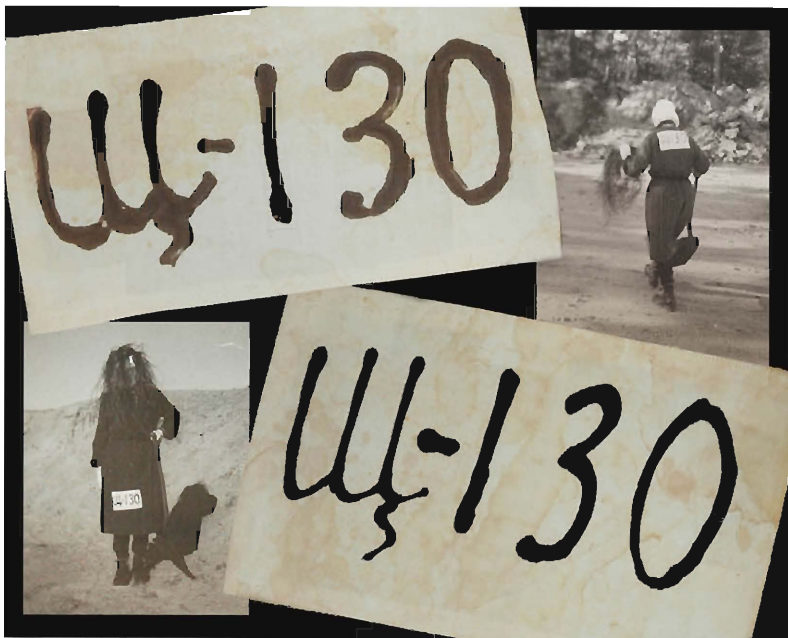
A woman repairing the Trans-Siberian Railroad (Elena Juciūtė).

In the photograph she is resting amongst the stumps that she had been toiling at.