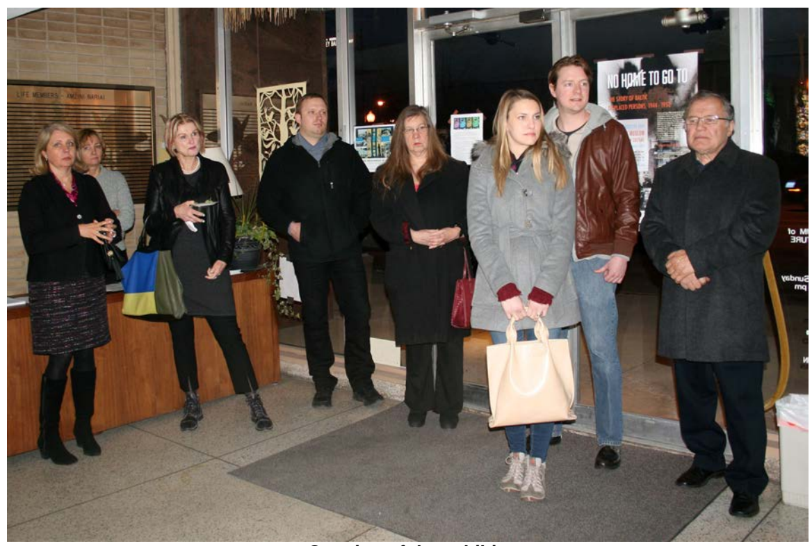
Opening of the exhibit.